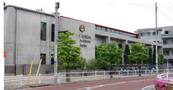
Christian Academy of Japan