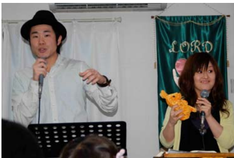
Worship at IBF Church

I thought that the cultural part of our trip would put me out of my comfort zone, however, rather than “cultural shock” I experienced “cultural appreciation.” The Japanese are very cleanliness-oriented. I was glad that we were advised to bring shoes we could easily remove. In every home and church we shed our shoes and were supplied slippers. The slippers were all EXTRA large! Our team rapidly learned to do a new dance I called the “slipper shuffle!” It’s tricky to do this dance up and down stairs!