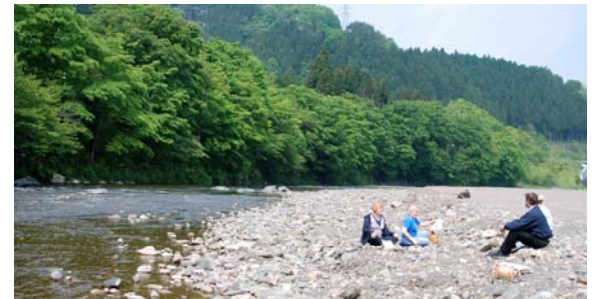
Prayer at the Konna River

After our visits my prayer journal was bulging! Our team concentrated on praying most the time, even in unlikely places – near the mountain of Akagi, by the side of a river, and at the top of a skyscraper. We even prayed on the sixteen trains we rode. Some were so crowded that we had to stand and hang onto ceiling rings. I called it “swaying and praying!” I think Paul would have been pleased that we were “increasingly devoted to prayer and prayed without ceasing.” Prayer gave us an incredible privilege of partnering with God to change lives. We trust our prayers lead to lasting change, glory to God and joy to many – including ourselves.