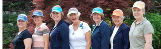
PACE team from the U.S.

Covenant women love excitement and adventure! The celebration, rejoicing and feasting prevalent at Triennial XII is still in motion with the advent of lively PACE trips. I was lucky enough to be one of seven women from around the U.S. who met for the first time in May 2008 to embark on a